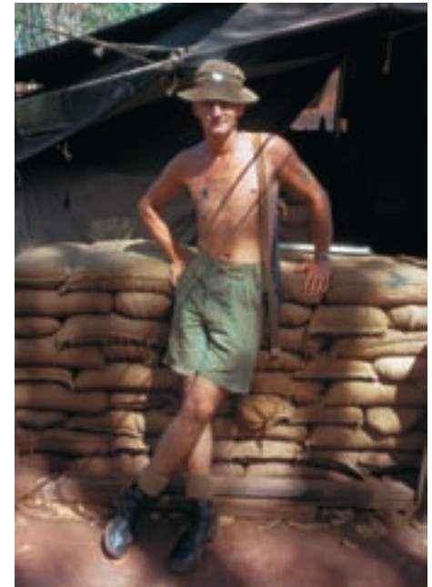
1968 Top left and right. Nui Dat seasonal profiles – the wet and the dry.

Bottom left. Shaving in the lines with every piece of spare timber put to some use – in this case, heavy ammunition boxes.