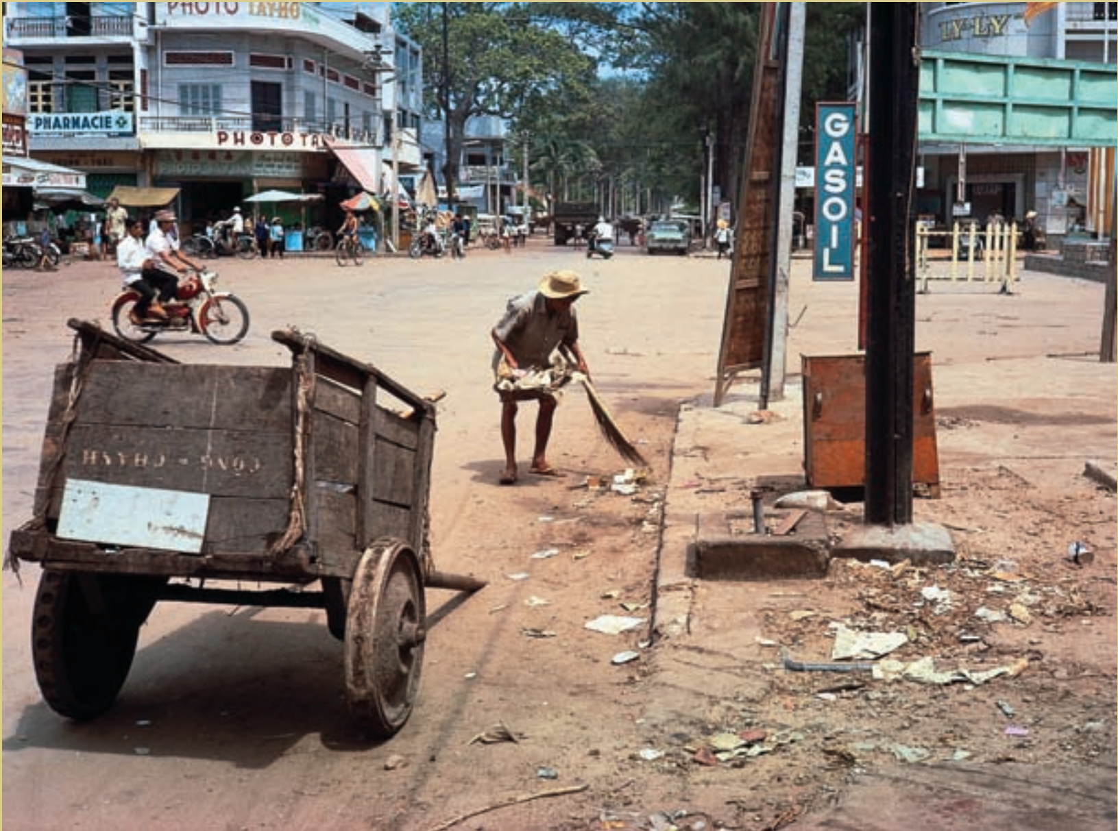
1968 Vung Tau council worker using the most primitive of equipment – which is still used today in South East Asia by cleaning staff. Larry Davenport