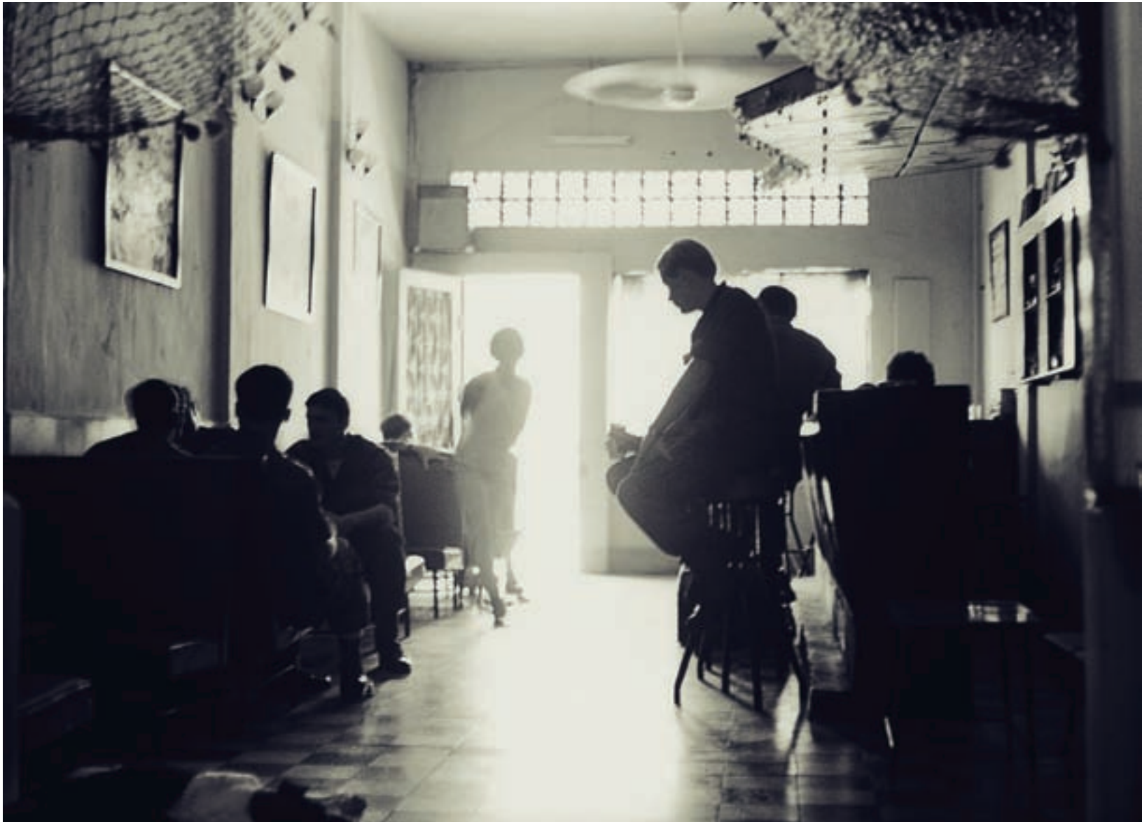
1970 The girl in the bar. A poignant photograph of typical Vietnamese bar and troops supporting it. The dog in the left foreground is oblivious to the moment.