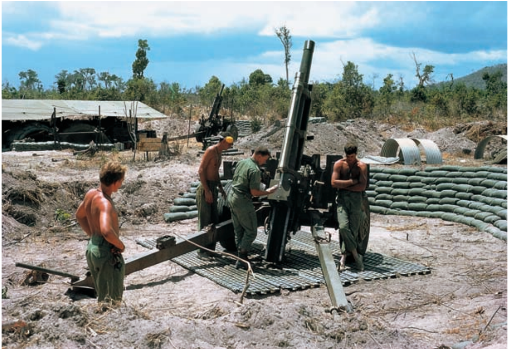
1969 Waiting for orders. Gunners of 105 Field Battery in a fire support base, with their M2A2 howitzer near to full elevation, await the command that invokes the weapons of the “dropshorts” or “eight mile infantry” as artillerymen are kiddingly referred to by other troops. Ted Robinson